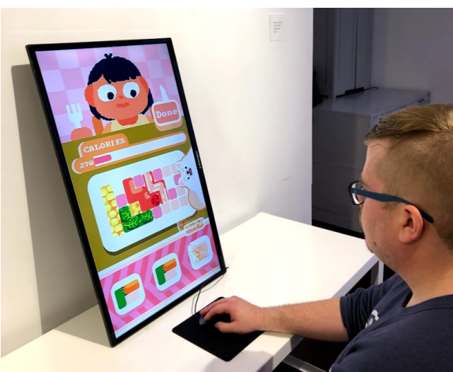
Opening Reception, System Link, January 24, 2020