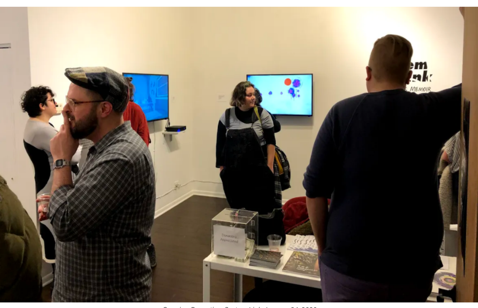
Opening Reception, System Link, January 24, 2020